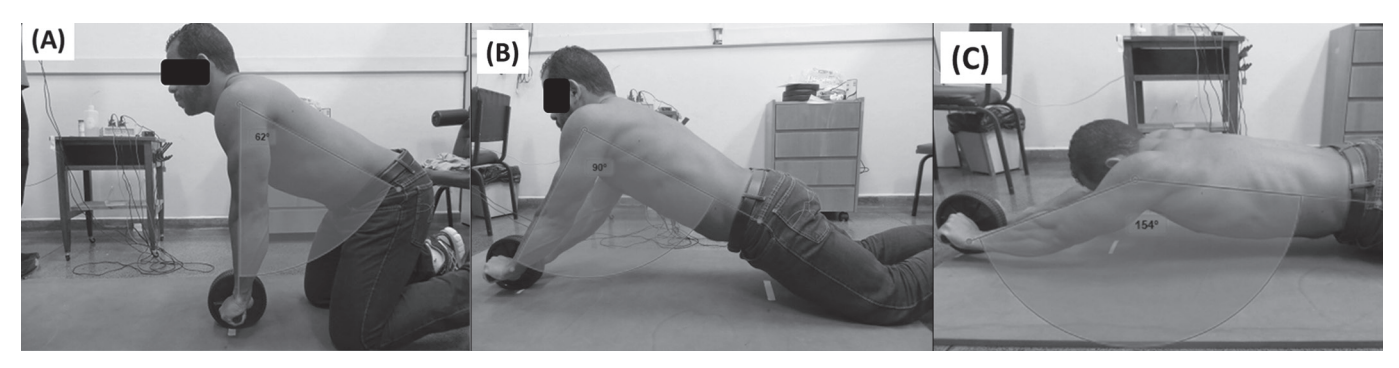
Figure 1 - Ab Wheel Rollout exercise: (A) neutral position; (B) 90 degrees position; and (C) 150 degrees position.

sEMG data was then normalized to the RMS peak of the two peak MVICs, the first second was removed from the normalized RMS, and the following 3 seconds of each trial was integrated (iEMG).